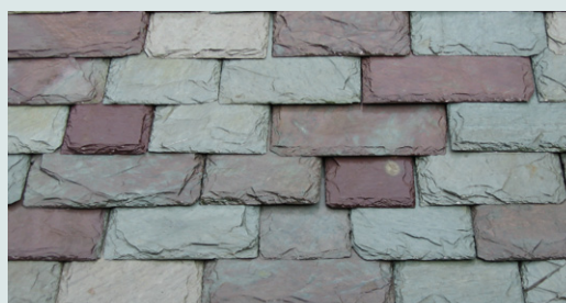
Evergreen Imperial Blend