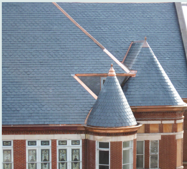
GENUINE BUCKINGHAM SLATE