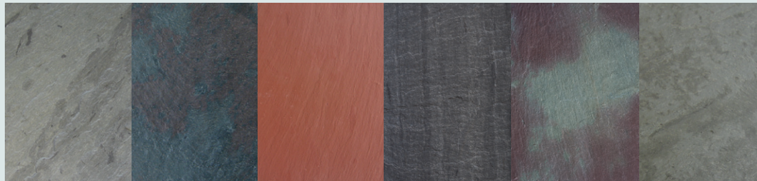
UNFADING* GRAY UNFADING* MOTTLED GREEN-PURPLE UNFADING* RED VERMONT BLACK VARIEGATED PURPLE UNFADING* GREEN