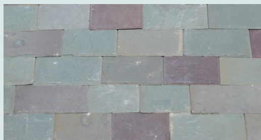
Evergreen Manor Blend

For additional texture, several thicknesses can be intermingled in each course of slate.