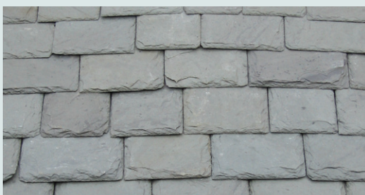
Evergreen Splendor Blend